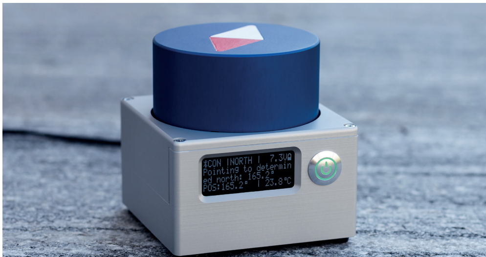
Fully integrated precision MEMS gyroscope in a standalone north-finder.